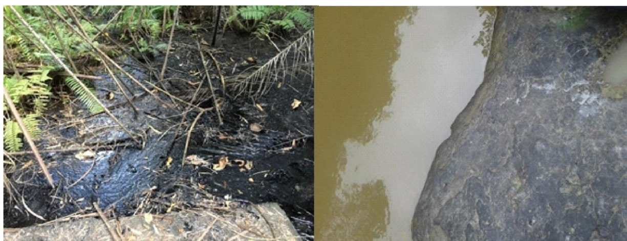
Figure 2: Bitumen seepages on river in Mile 2 and Ilubirin communities

a thick clay sequence that is overlain by oil sands indicating the presence of oil sands at shallow depths. The presence of oil sands deposit at a very shallow depth was confirmed from the holes that was dug hole as shown in Figure 5, indicating that surface mining can be carried out on some of the oil sands deposits in Ondo state. An extensive outcrop which covers some kilometres was intercepted by our team at different locations in Ogun state as shown in Figure 6.