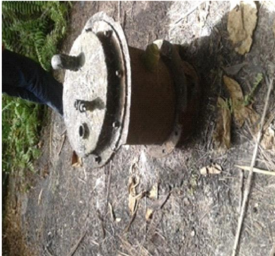
Figure 3a: Sealed drilled holes