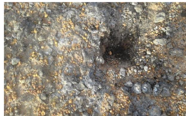
Figure 6b: Tar sand outcrops in Imeri, Ogun state