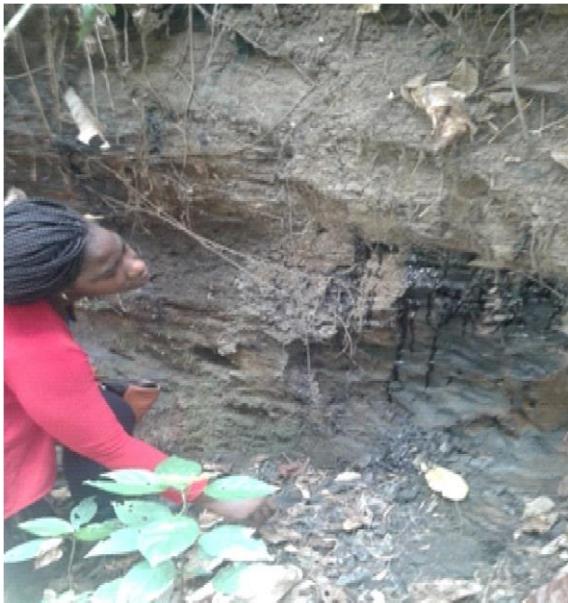
Figure 4a: Observing thick clay sequence overlaid by oil sands