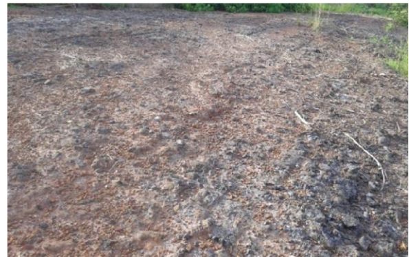
Figure 6a: Tar sand outcrops in Onipanu, Ogun state