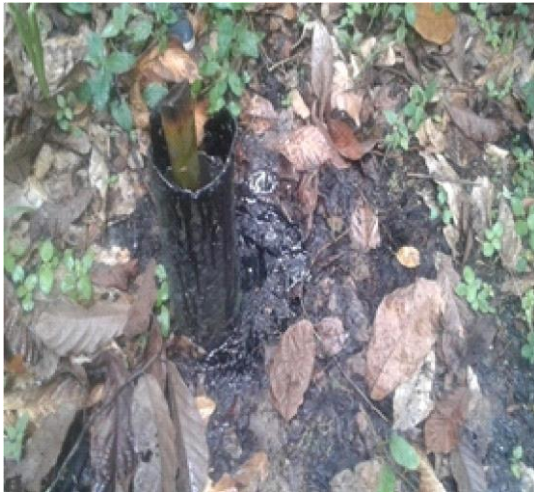
Figure 3b: Unsealed drilled holes