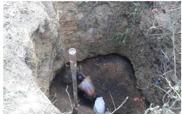
Figure 5: A shallow well dug to locate bitumen deposit during the field trip