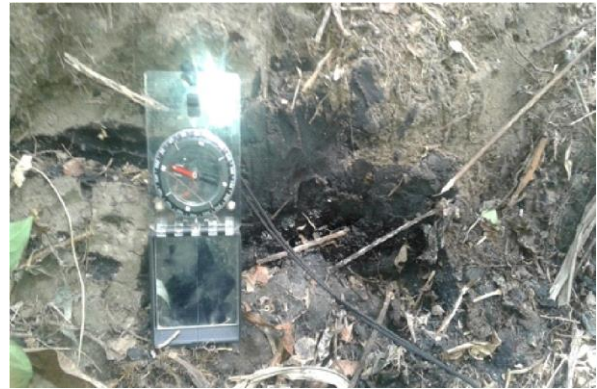
Figure 4b: Thick clay sequence overlaid by oil sands